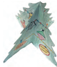
Different angles of completed tree.