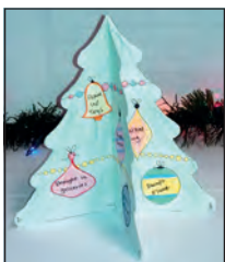
Weeks 1 & 2 together.